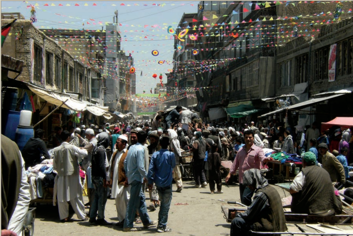
Afghans shopping , getting food, chatting, and resting in Kabul's busy Mandawi Market.