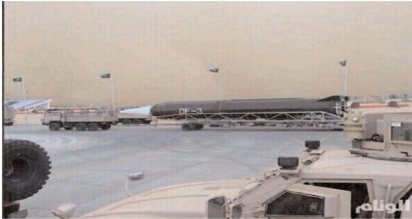
Figure 10. Saudi CSS-2 at the Sword of Abd-Allah Exercise Parade, Al-Wi'am (Saudi Arabia), 29 April 2014.

In many ways, the public display of the missiles and the accompanying Saudi commentary did much to crystallize and underline the broader enduring themes of Riyadh's thinking, such as its mistrust of Iranian policy and conviction that Tehran intends to continue its quest to acquire nuclear weapons despite any agreements reached, unease about the reliability of U.S. security guarantees, pique at some of the GCC states for their more benign outlook on Iran, national pride, faith in the effectiveness of the concept of deterrence, the portrayal of nuclear weapons and SSM as a package, and a renewed warning of the Saudi option to pursue a nuclear deterrent if Iran does so.