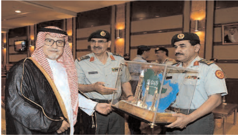
Figure 6. The SRF presenting models of three missiles to the visiting then-Deputy Minister of Defense Prince Fahd bin Abd-Allah, Al-Riyadh , 21 May 2013.

The message was that Saudi Arabia now also had potentially two SSMs other than the CSS-2, or at least two versions of an additional SSM type including, perhaps, the nuclear-capable solid-fuel-propelled Shaheen II from Pakistan, a country with which Riyadh has had a long-standing military relationship. 122 Saudi interest in Pakistan’s SSM production was evident as early as 1999, when Prince Sultan visited that country’s defense industry. At the time, the Saudi press had reported that he had viewed a film about Pakistan’s missiles at the factory where they were produced but that he had not entered the secure areas of the factory. 123 However, the Pakistani nuclear scientist A.Q. Khan more recently has claimed that he had briefed Prince Sultan personally and had shown the latter the actual weaponry, including “the Ghauri missiles [a predecessor to the Shaheen], [and] nuclear weapons (one fitted into a Ghauri warhead).” 124 In early 2014, Newsweek reporting, based on an unnamed, “well-placed intelligence source,” confirmed that Saudi Arabia had indeed bought the CSS-5 from China in 2007. Ostensibly, the deal occurred with U.S. approval, with American inspectors satisfied that the new missiles “were not designed to carry nukes.” 125