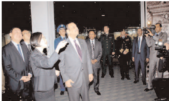
Figure 8. Prince Khalid visiting the Poly Group Corporation in China, Al-Riyadh , 4 April 2013.

Even if not for manufacturing, it would appear that Saudi Arabia has still been seeking SSM-related technology abroad and that it may have already developed some resident capability—whether thanks to local or foreign experts—to at least modify SSMS. Prince Bandar himself has claimed that the accuracy of Saudi Arabia’s SSMS “had since been improved by indigenous modifications.” 136 In 2009, significantly, the United States raised questions with Ukraine about a planned transfer of SSM technology to Saudi Arabia, citing the fact that such “category one” SSM technology is suitable to vehicles for delivering WMD, despite assurances by Ukrainian officials that that was not what it would be used for. 137 And, Saudi universities have sent engineering student delegations to visit South Korean factories, including those for the manufacture of space satellites and missiles. 138 In April 2013, Prince Khalid, then still Deputy Minister of Defense, visited China for high-level discussions and toured Poly Group Corporation, a defense conglomerate whose sale of products included the original missile sale to Saudi Arabia. 139 Although the Saudi media did not connect the company with the production of missiles, since photos of his visit to Poly were made public, the intent was probably to send a subtle message to Iran and other foreign governments. (See Figure 8)