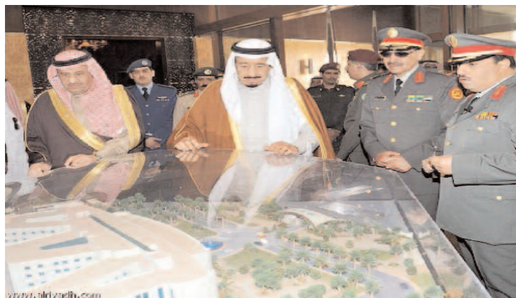
Figure 3. Minister of Defense Prince Salman viewing a model of the new SRF Headquarters in Riyadh, Al-Riyadh , 27 November 2011.

Likewise, at the ceremony of the opening of the SRF's new headquarters in 2010, in the presence of the then-Deputy Minister of Defense Prince Khalid, the SRF commander, Staff Major General Jar-Allah al-Awit, said that the Saudi leadership "understood ... the important role this type of weaponry [i.e. SSMs] plays in deterring any threat to this country's holy places and national assets." 33 (See Figure 3)