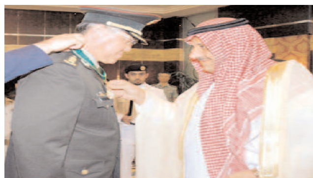
Figure 4. Prince Khalid decorating Chinese General Li An Dong, Al-Watan , 6 October 2010.

Of course, in tandem with the material expansion, there has also been an expansion of the human sector. Initially, technical support and very probably the actual operational handling of the SSMs was in the hands of Chinese advisers, and one can assume reasonably that it was Chinese personnel who conducted the operational functions related to the new SSMs when a launch was contemplated in 1988, given the short lead-time between purchase and delivery and the inability to have trained Saudi personnel by that time. A Chinese presence may well have continued for many years thereafter, as suggested by the fact that as late as 2010 the King awarded one of the country's highest decorations to the Chinese head of the Joint Military Committee in recognition for "strengthening friendship and cooperation." 107 Since the ceremony was hosted by Saudi Arabia's SRF, the event was clearly in connection with China's support of the SSM program. (See Figure 4)