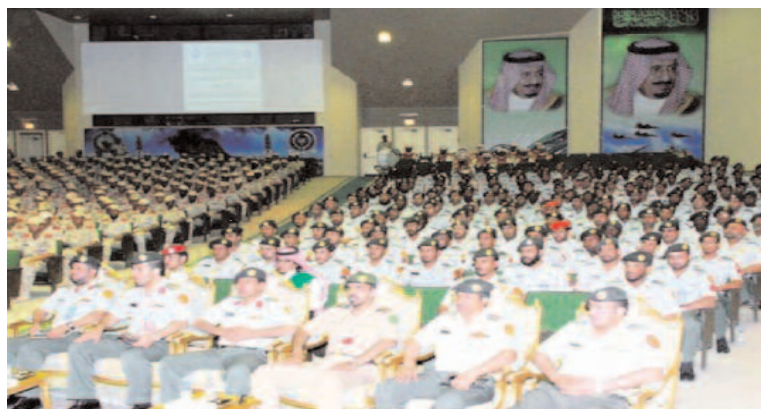
Figure 5. Graduation ceremony for students in various courses at the SRF School, Al-Sharq (Dammam), 7 June 2012.

Recruitment, based on some of the names of those in the senior ranks, seems to follow a pattern of preference for tribal individuals, as is true for much of the Saudi military, at least for the non-technical positions. For the past few years, the yearly recruitment cycle has been publicized in the local media, with the SRF seeking candidates at all levels, with initial rank depending on educational experience, up to captain for those with a university degree. Reflecting the sensitive nature of the service, a candidate's spouse cannot be a foreigner. Officers destined for the SRF are educated at the country's Air Defense Academy in Al-Ta'if. 114 New enlisted recruits go through a three-month basic course at the SRF School at Al-Sulayyil Base, followed by a six-month technical course for those doing technical work. New officers and warrant officers also attend a course lasting almost a year in the SRF School. (See Figure 5) The same school also provides specialized training and students can also attend other schools for technical courses, such as the national Institute for Military Geography and Terrain. Some officers also finish a four-month technical course at the civilian Technical College in the town of Wadi Al-Dawasir, near Al-Sulayyil. 115