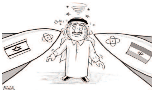
Figure 9. The Gulf is shown as threatened by both Israeli and Iranian nuclear-armed missiles, Al-Jazira (Riyadh), 21 December 2011.

Riyadh has long viewed Israel as a threat to the Arab world, given its imposing SSM and nuclear capabilities, and Tel Aviv's assumed possession of nuclear weapons for decades has led to ingrained Saudi perceptions, at least in public opinion, of a continuing active Israeli nuclear threat, and a future Iranian threat would only join, rather than displace, the existing Israeli one. Thus, one Saudi observer in 2006 typically characterized "the Arabs [as] between the pincers of the Israeli and of the Iranian nuclear deterrents." 142 Such perceptions have persisted and, in 2010, another editorialist spoke of the Arabs as living "between the two halves of a pincer, one of which is Iran ... in connection with its nuclear program, and the other of which is Israel." 143 (See Figure 9)