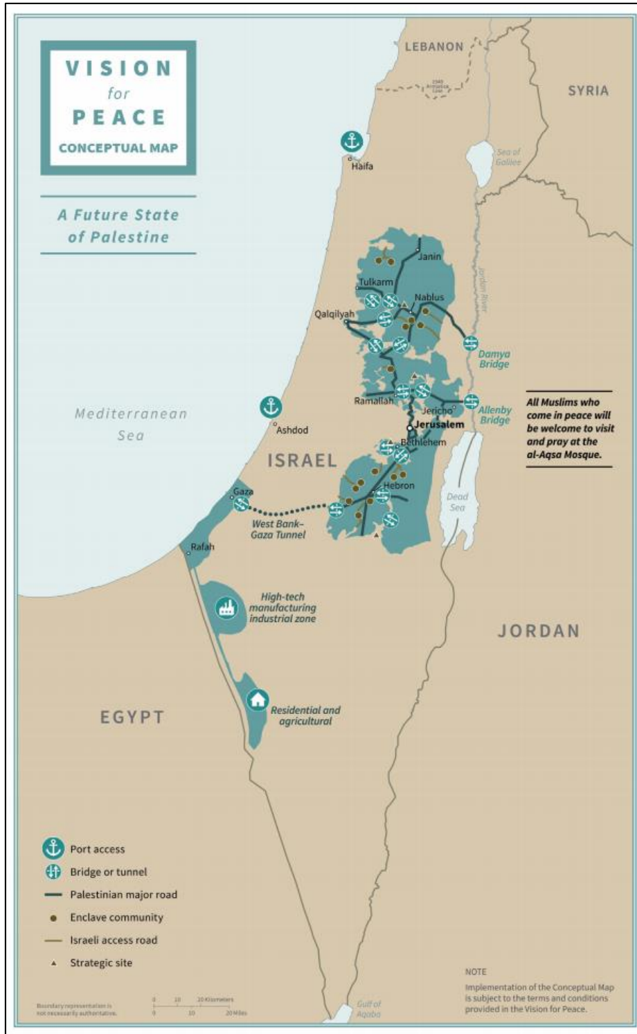
Figure D-2. Conceptual Map of Future Palestinian State