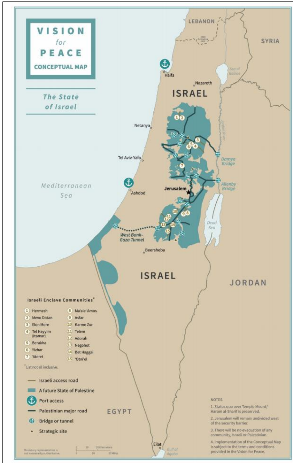
Figure D-1. Conceptual Map of Israel