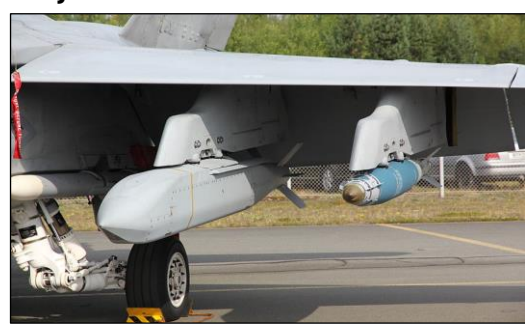
Figure 3. JASSM Attached to an F/A-18D Hornet