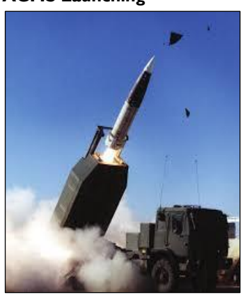
Figure 4. ATACMS Launching