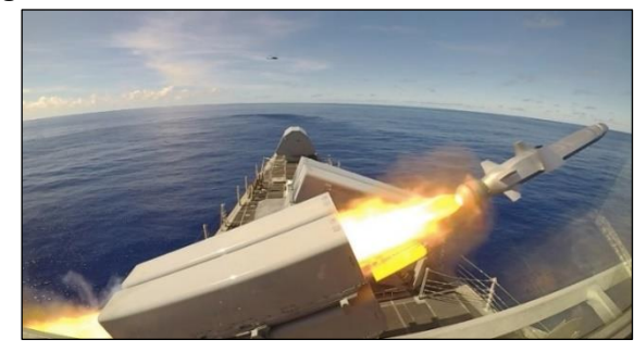
Figure 5. NSM at Launch