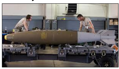
Figure 2. GBU-31 Joint Direct Attack Munition